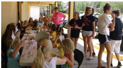
Princesses enjoying a 'royal' tea party.