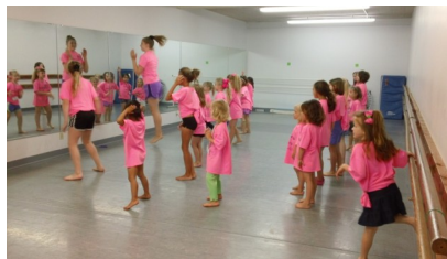
Princesses learning their dance to "Someday My Prince Will Come". They performed for family and friends Thursday afternoon.